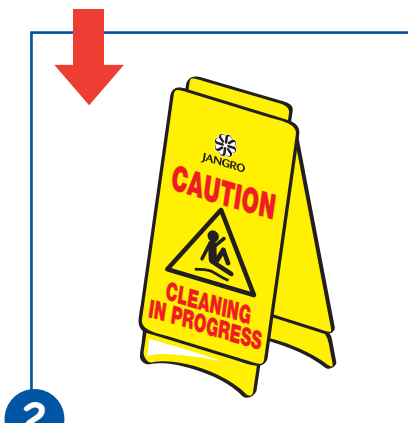
2 Place safety signs.