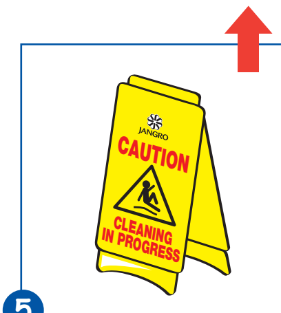
5 Remove safety signs.

Health & Safety Please refer to relevant COSHH Sheet.