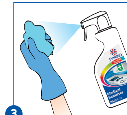
3 Spray solution onto cloth and wipe.